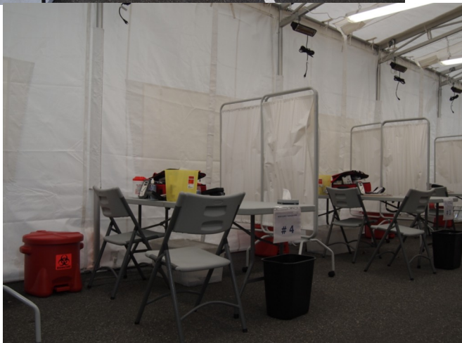
Clockwise from top left: MMU tented structure partially set-up around the unit—from the photo you can see that the structure relies on the MMU trailer itself as a central support.; PHAC mini-clinic supplies set-up inside the tented structure; PHAC mini-clinic supplies palletized, prior to set-up; and triage stations (part of the PHAC mini-clinic) set-up inside the MMU tented structure.